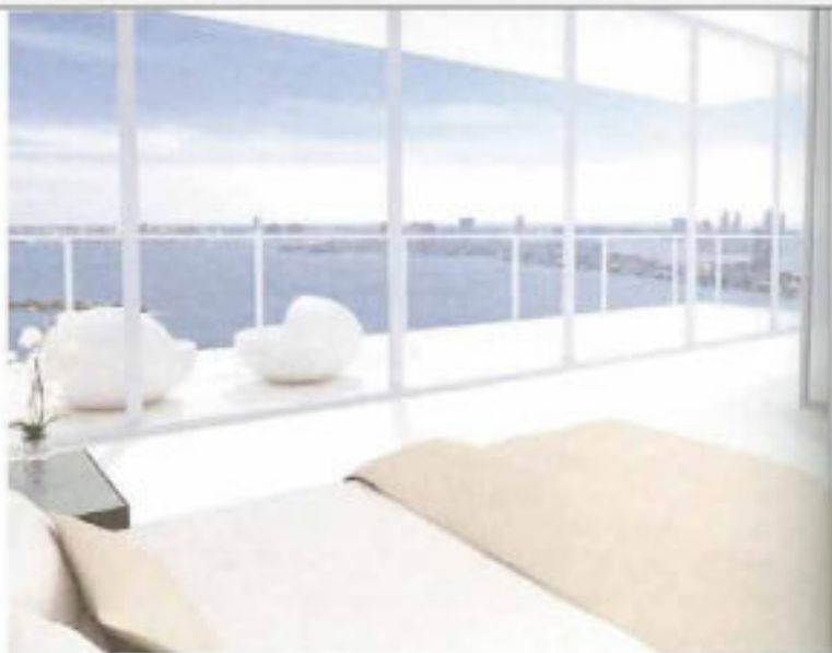
LEFT: Night View from Biscayne Bay. ABOVE: Typical bedroom looking east. BELOW: One of the more sought after units is this 3-bedroom, 2.5-bath with three terraces.

says building lower, more massive structures is cheaper. Architectonica and Royal Palm seem to be saying just the opposite with this design. Leave luxurious amounts of open space, build tall, thin and let the breeze flow through. This may be a more expensive solution, but the end result is a far more desirable building... and helps create a more dynamic city.